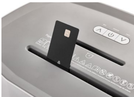
DAHLE PaperSAFE® document shredder 240 DAHLE PaperSAFE® document shredder 240