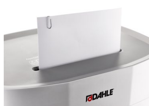
DAHLE PaperSAFE® document shredder 240 DAHLE PaperSAFE® document shredder 240 DAHLE PaperSAFE® document shredder 240