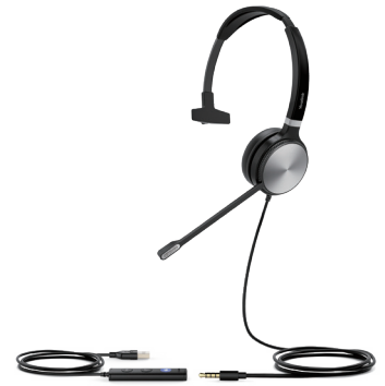
UH36 Mono Teams UH36 Mono UC

Deeply integrated with Yealink IP phones that the advanced features, such as volume synchronization and multiple calls control, are just right at your fingertips.