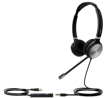
UH36 Dual Teams UH36 Dual UC