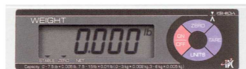
Large Display Panel

Answering the call for simplicity, portability and reliability...the iPC delivers exceptional all-around performance.