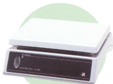
Dual Display Model