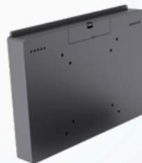
• Android Box Module

Intel® N97 (6M Cache, up to 3.60 GHz) Intel® Core™ i3-1215U(10M Cache, up to 4.40 GHz) Intel® Core™ i5-1235U(12M Cache, up to 4.40 GHz)