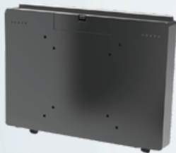
• Windows Box Module

Intel® N97 (6M Cache, up to 3.60 GHz) Intel® Core™ i3-1215U(10M Cache, up to 4.40 GHz) Intel® Core™ i5-1235U(12M Cache, up to 4.40 GHz)